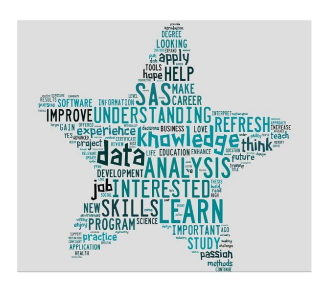
Pic. 2. Cloud of words drawn from the responses of students [8]

Supporting materials were presented in the form of text also video lectures and demonstrations. List of the best blogging was introduced to other students for acquaintance [8].